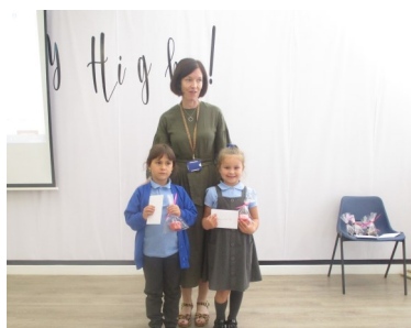
Year 1 Birthday Bubble Assembly