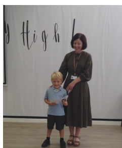
Reception Birthday Bubble Assembly