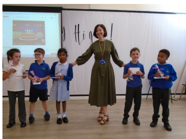
Year 2 Birthday Bubble Assembly