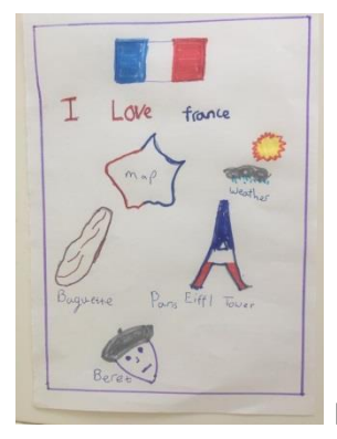
Paris' Around the World Home learning