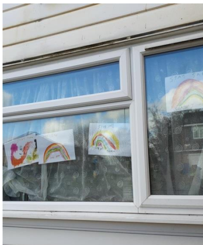
The Hettle family